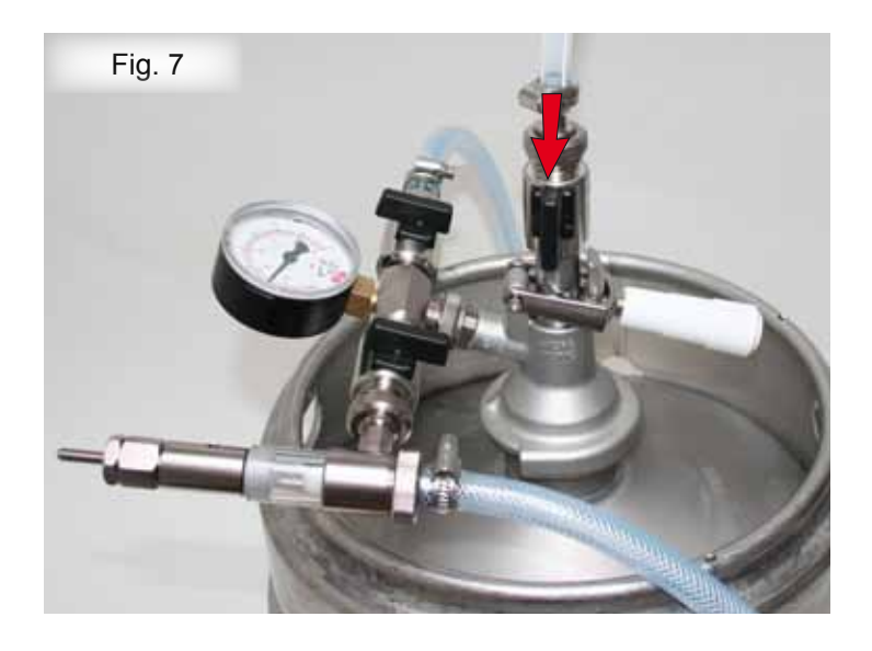
Open ball valve III (beer supply). Pump pressure in the beer line must be approx. 2.5 bar.